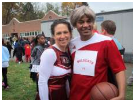
OMG!! It's Gabriella and Troy!!!!!!!!!!!!!!