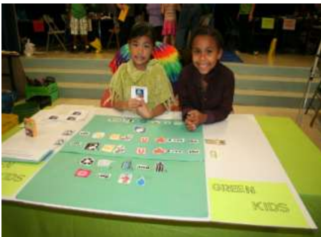
Thanks to all the Green Kids for your work!!