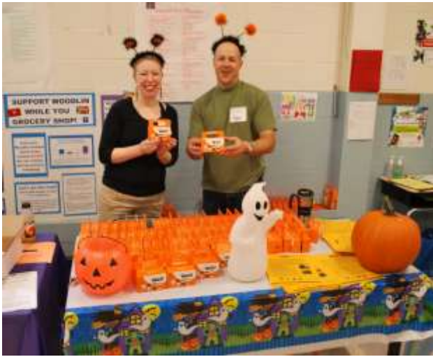
The Expo also kicked off the UNICEF Drive Fundraiser.